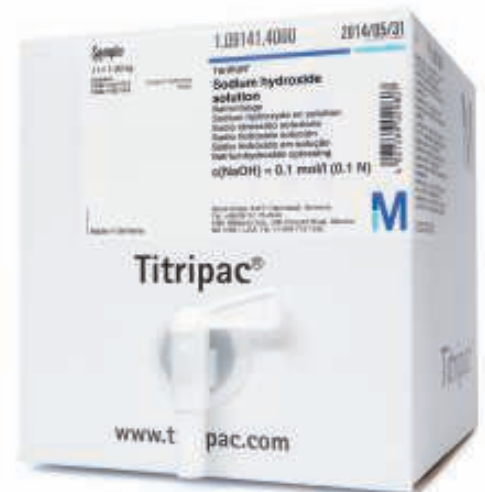
Titripac® is available in 4 liter and 10 liter sizes.