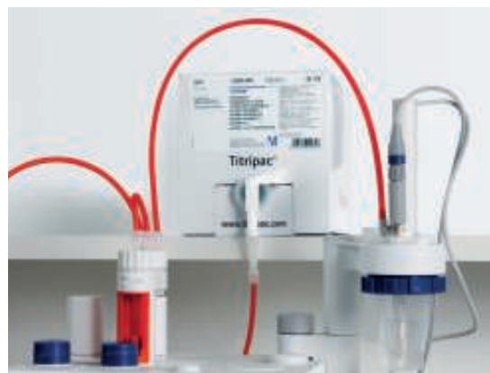
Precise analyses require precisely adjusted volumetric solutions. With Titripac® you can be sure that you've got a consistent solution up to the very last drop. A direct connection to the titrator via an adaptor makes lab work easier and helps to avoid contamination.