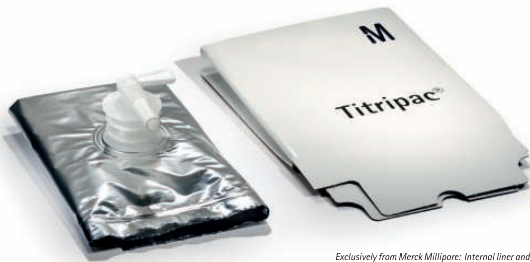
Exclusively from Merck Millipore: Internal liner and external carton can be easily disposed of separately.