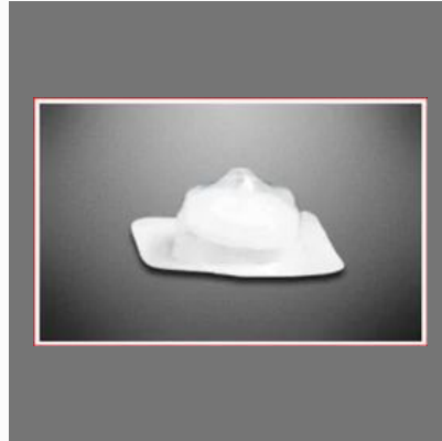
PES Syringe Filter