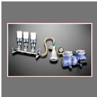
Filter Assembly Complete Three Place