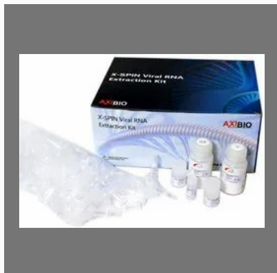
Rna Extraction Kits