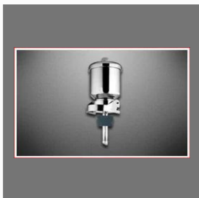
Membrane Filter Funnel