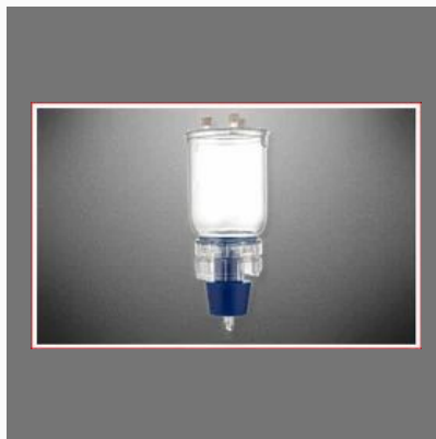
Filter Funnel Single Unit