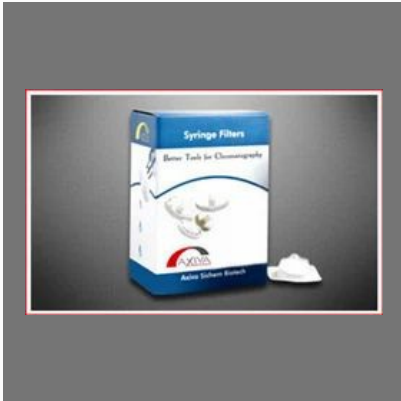
PVDF Syringe Filters