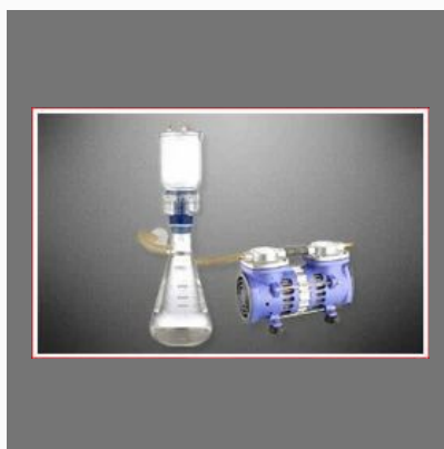
Filter Assembly Single Unit