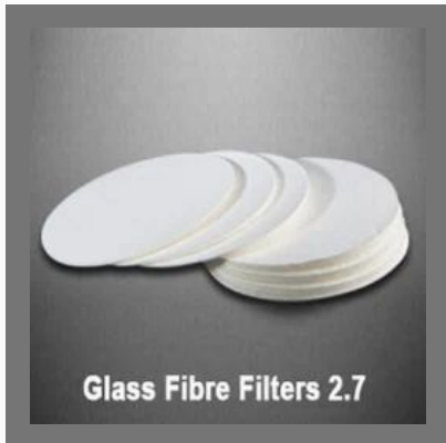
Glass Fibre Filters 2.7