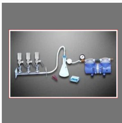
Three Place Assembly with Glass Funnel