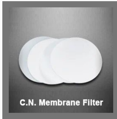
C.N. Membrane Filter