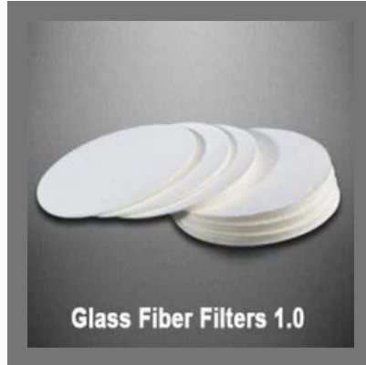
Glass Fiber Filters 1.0