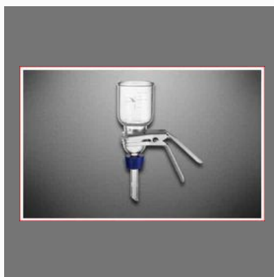
Membrane Filtration Funnel Glass