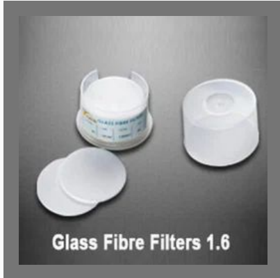
Glass Fiber Filters 1.6