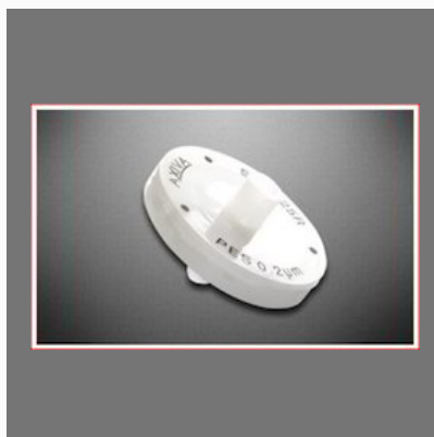
Axodisc Double Layered Syringe Filter