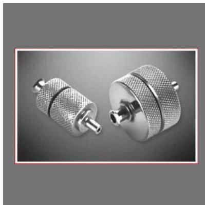
SS Syringe Filter Holder