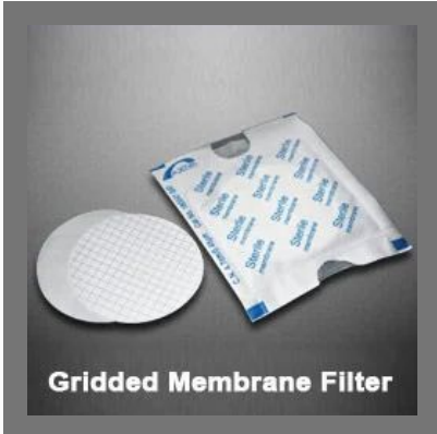
Gridded Membrane Filter