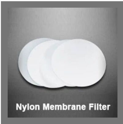
Nylon Membrane Filter