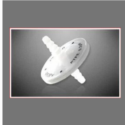
Air Vent Filter