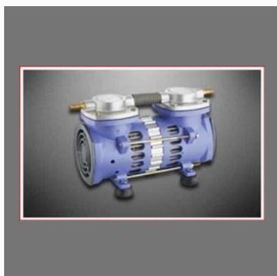
Vacuum Pump For Single Place Assembly