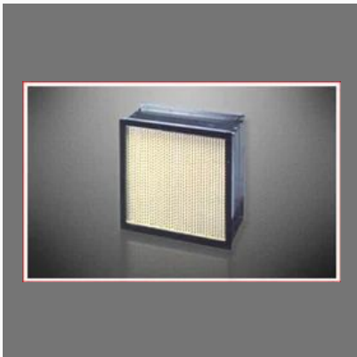
Clean Room Filter