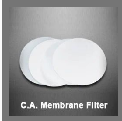
C.A. Membrane Filter