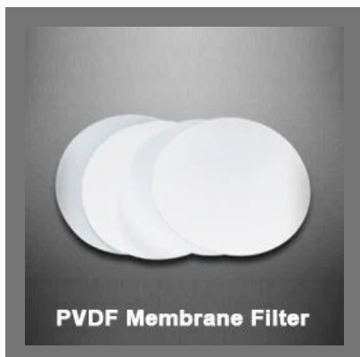
PVDF Membrane Filter