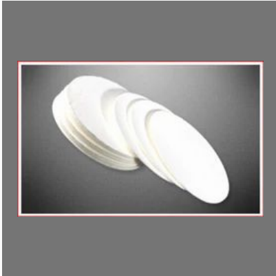
Hardened Ashless Filter