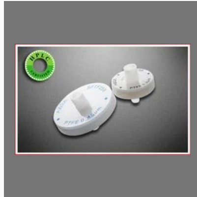
PTFE Syringe Filters