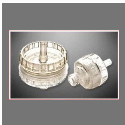
PC Syringe Filter Holder