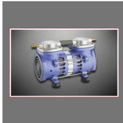
Vacuum Pump For Single Place Assembly